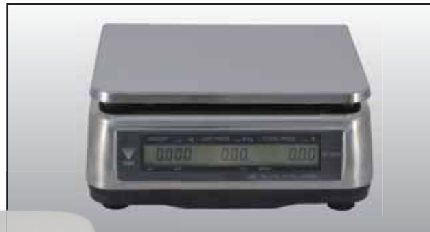
Customer side display

Preset keys to call up unit price or PLU for fast transactions