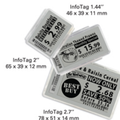
InfoTag 2" 65 x 39 x 12 mm

Display accurate prices with attractive bitmap image and scannable barcode.