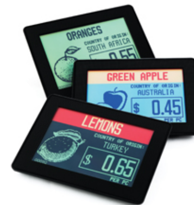
InfoCard 226 x 170 x 18 mm

Database updates at the server are automatically sent to the InfoCard and InfoTag, ensuring that pricing is in sync with the checkouts at all times.