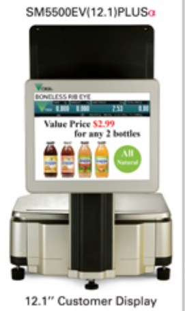
12.1" Customer Display