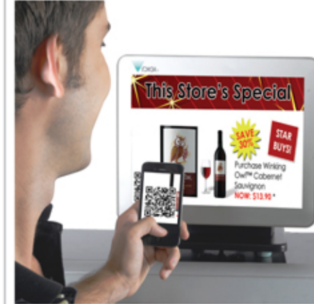
QR Code Scanning

Additional information such as nutrition, origin, useful tips and recommended recipes can automatically be prompted to counter staff at the point of purchase to up sell or cross sell whenever the opportunity arises.