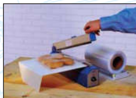
Table sealer equipped with timer and cutter for making bags or trimming excess material. Shown here with a foil unrolling unit and a work table, both available as extra accessories.