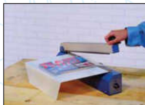
Table sealer equipped with timer and a 0.5mm teflonized trimwire to seal and cut in one operation.