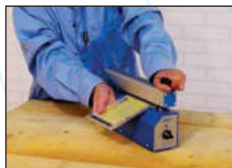
Table sealer equipped with 2mm wide seal wire and timer. Suitable for sealing bags.